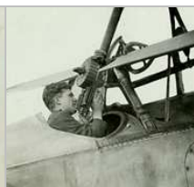
A Day in My Life